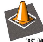
"OK" (NO PENALTY)